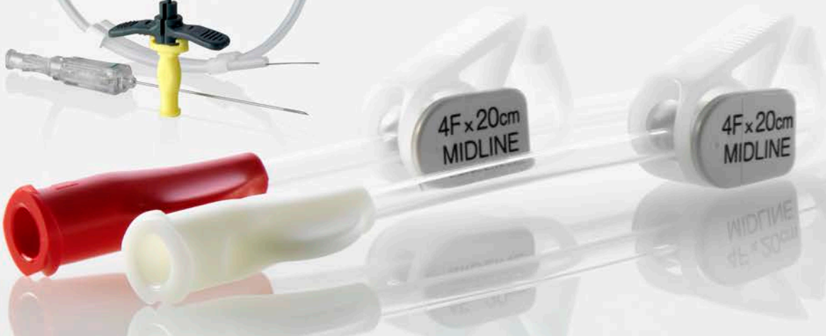
"Midline" labeling on I.D. Tags