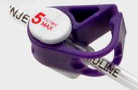
Printed identification and purple color denote maximum flow rates for contrast injection.