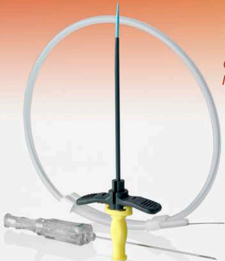
CT Midline with MST Placement